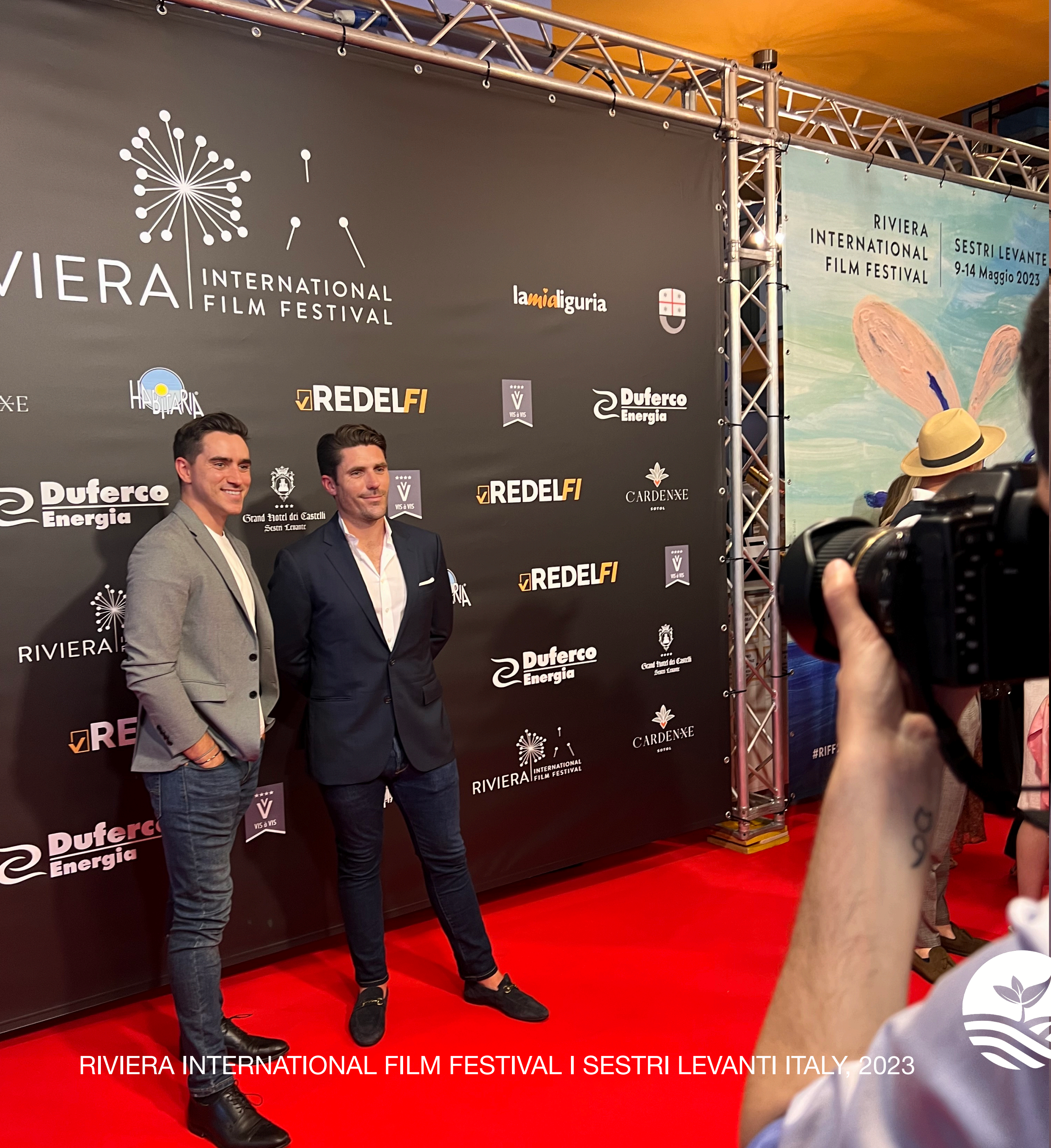
RIVIERA INTERNATIONAL FILM FESTIVAL I SESTRI LEVANTI ITALY, 2023