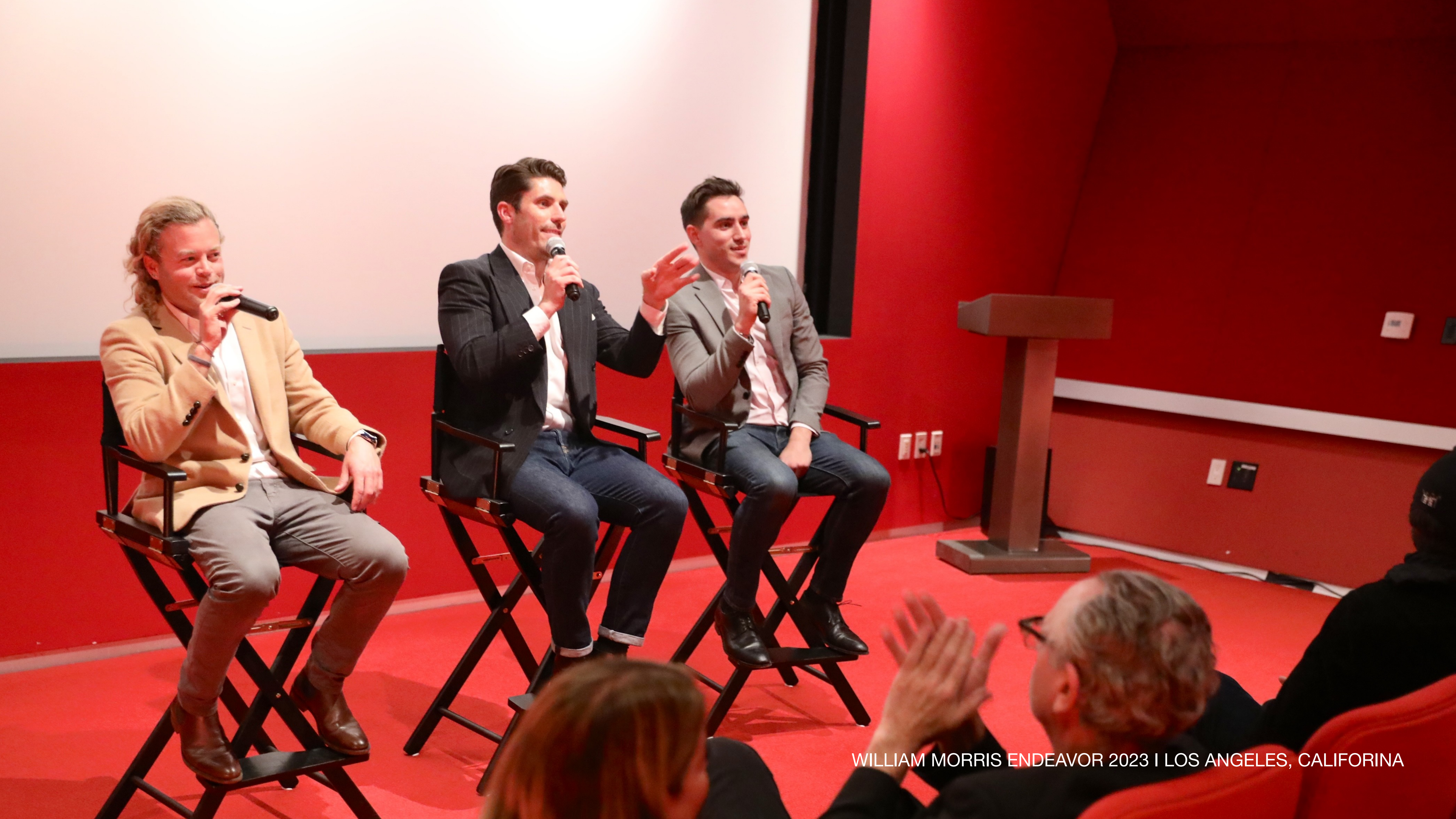
WILLIAM MORRIS ENDEAVOR 2023 | LOS ANGELES, CALIFORNIA