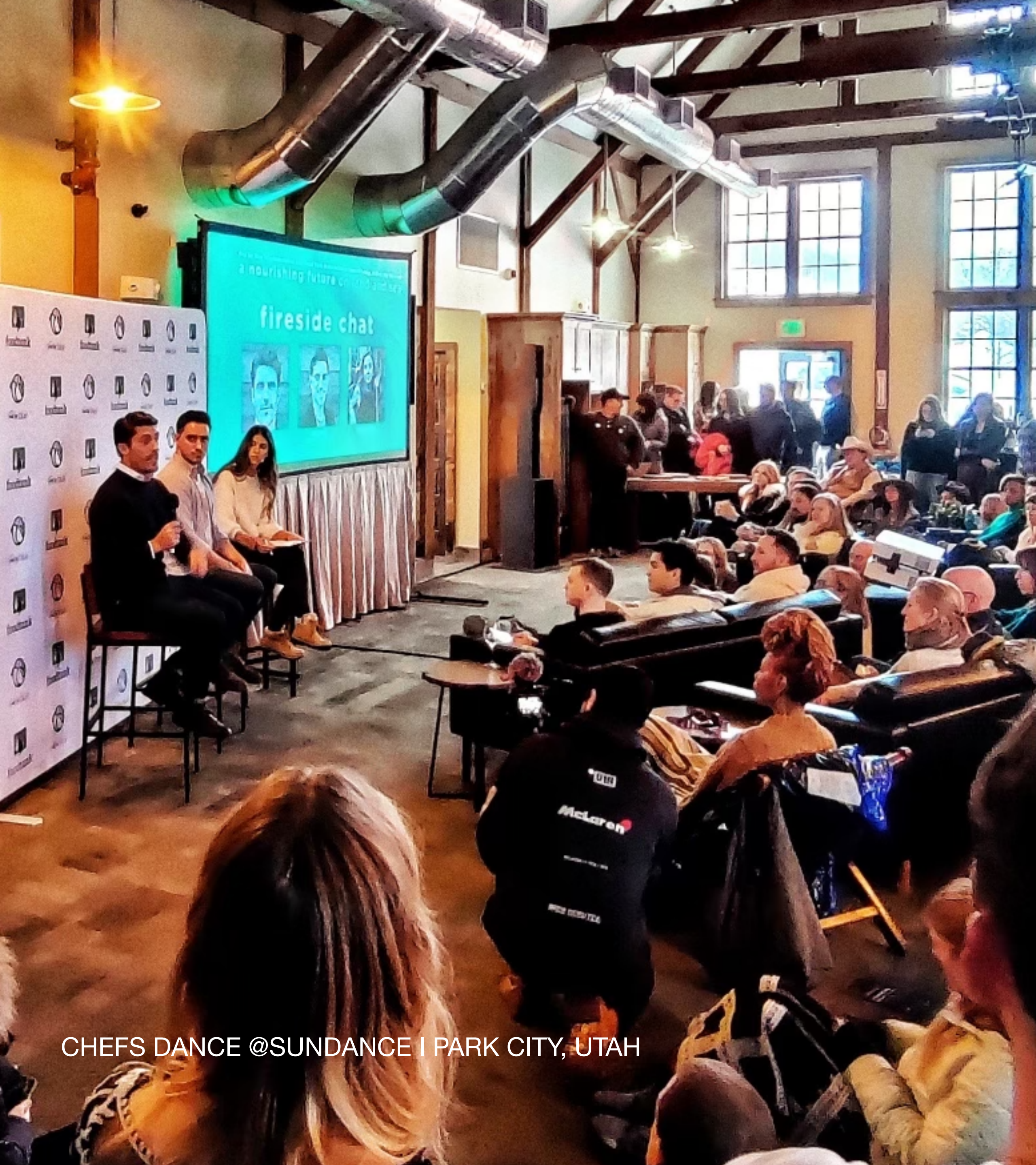
CHEFS DANCE @SUNDANCE | PARK CITY, UTAH