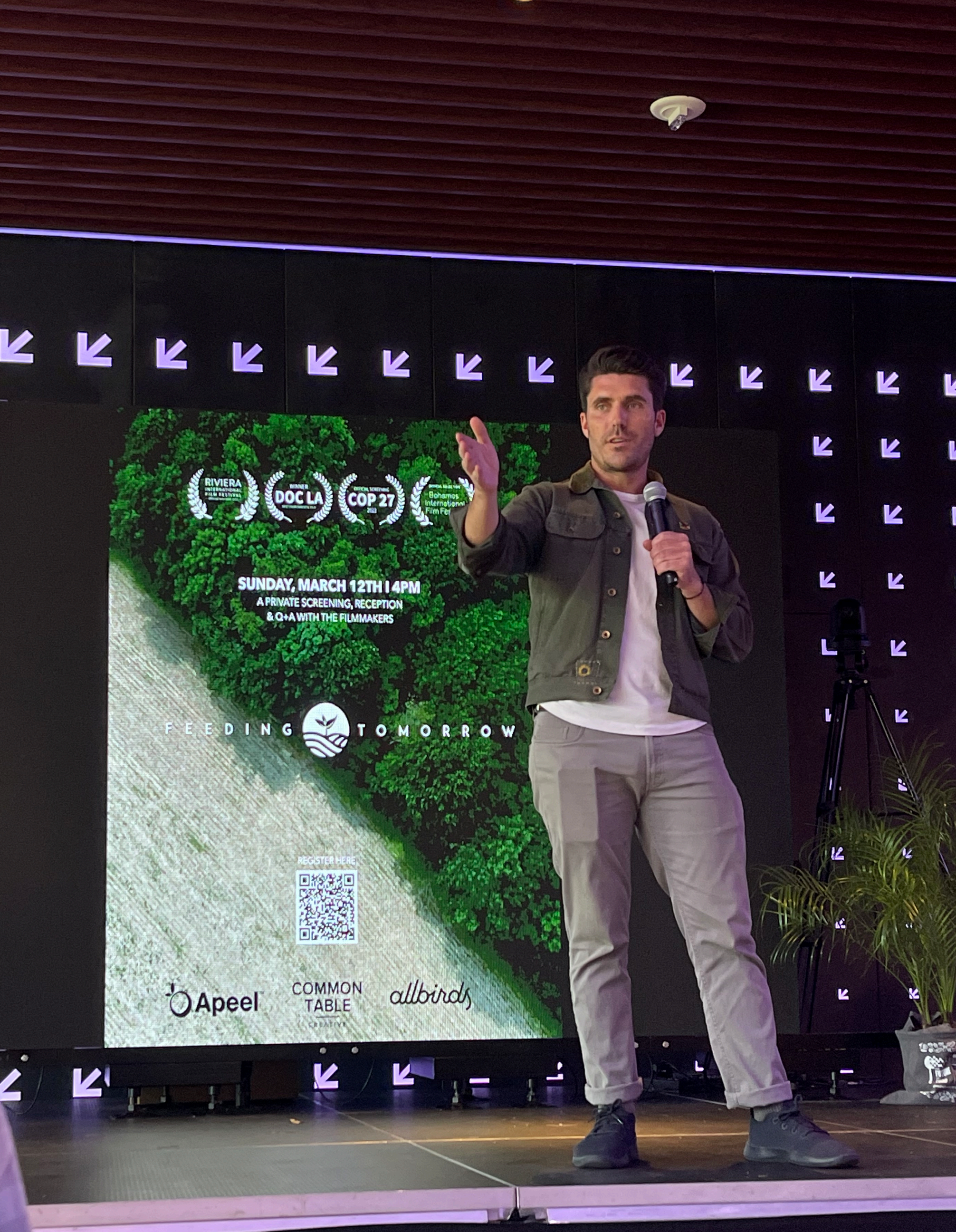
SXSW FUTURE OF FOOD 2023 | AUSTIN, TEXAS