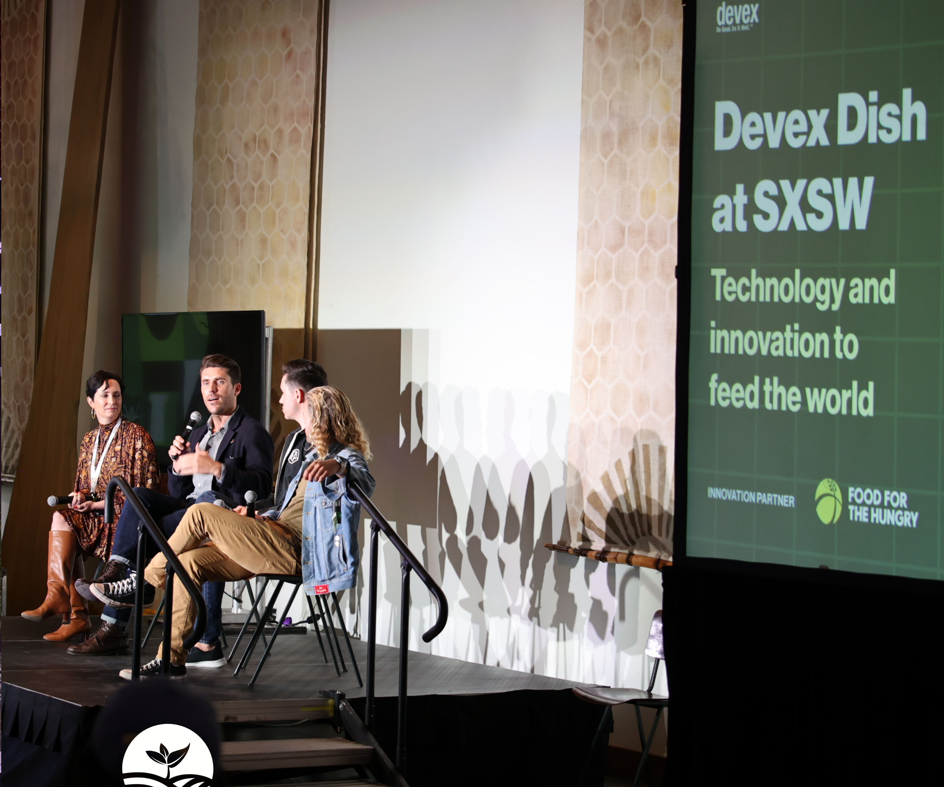
SXSW DEVEX CONFERENCE 2023 | AUSTIN TEXAS