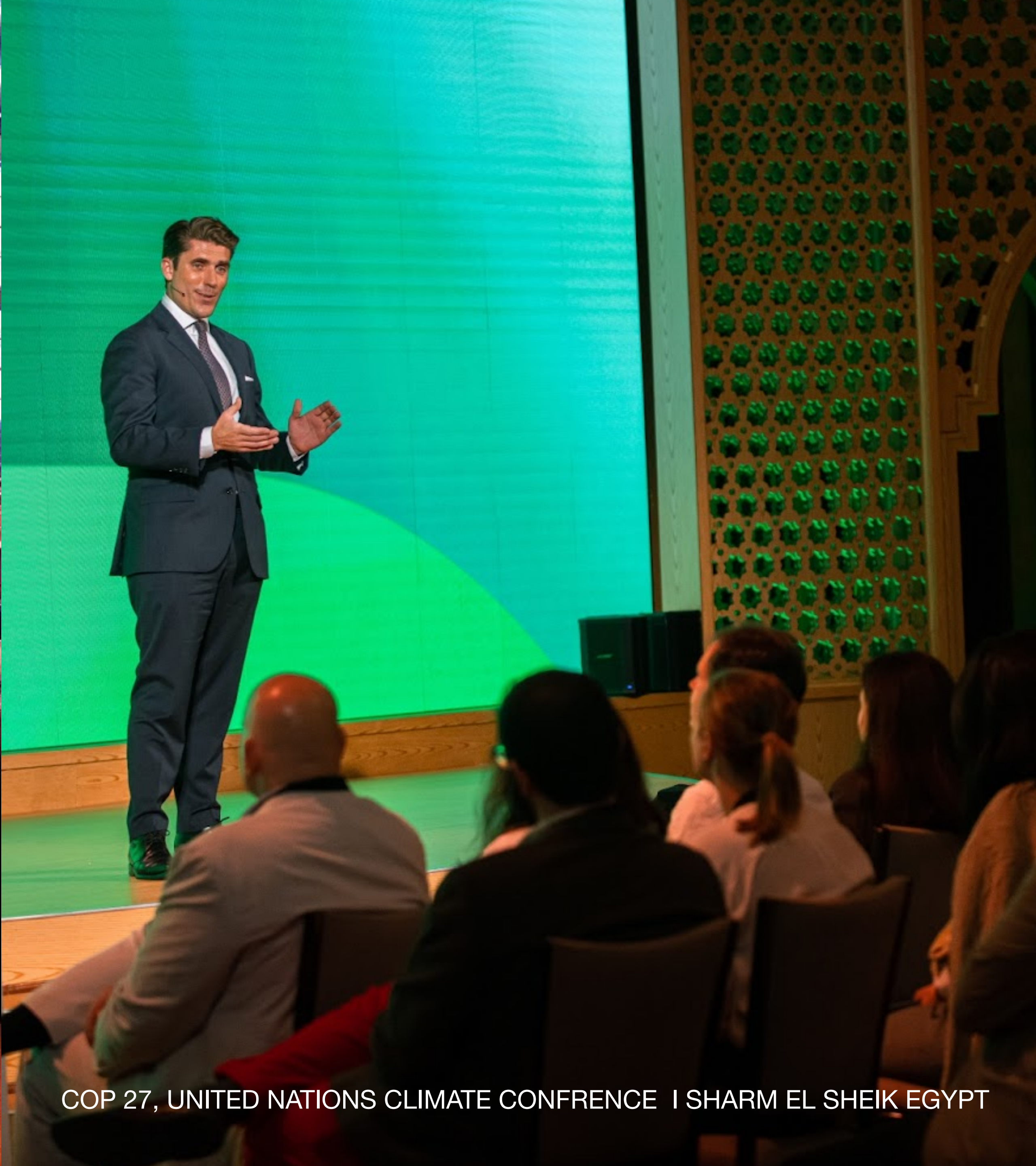
COP 27, UNITED NATIONS CLIMATE CONFERENCE | SHARM EL SHEIK EGYPT