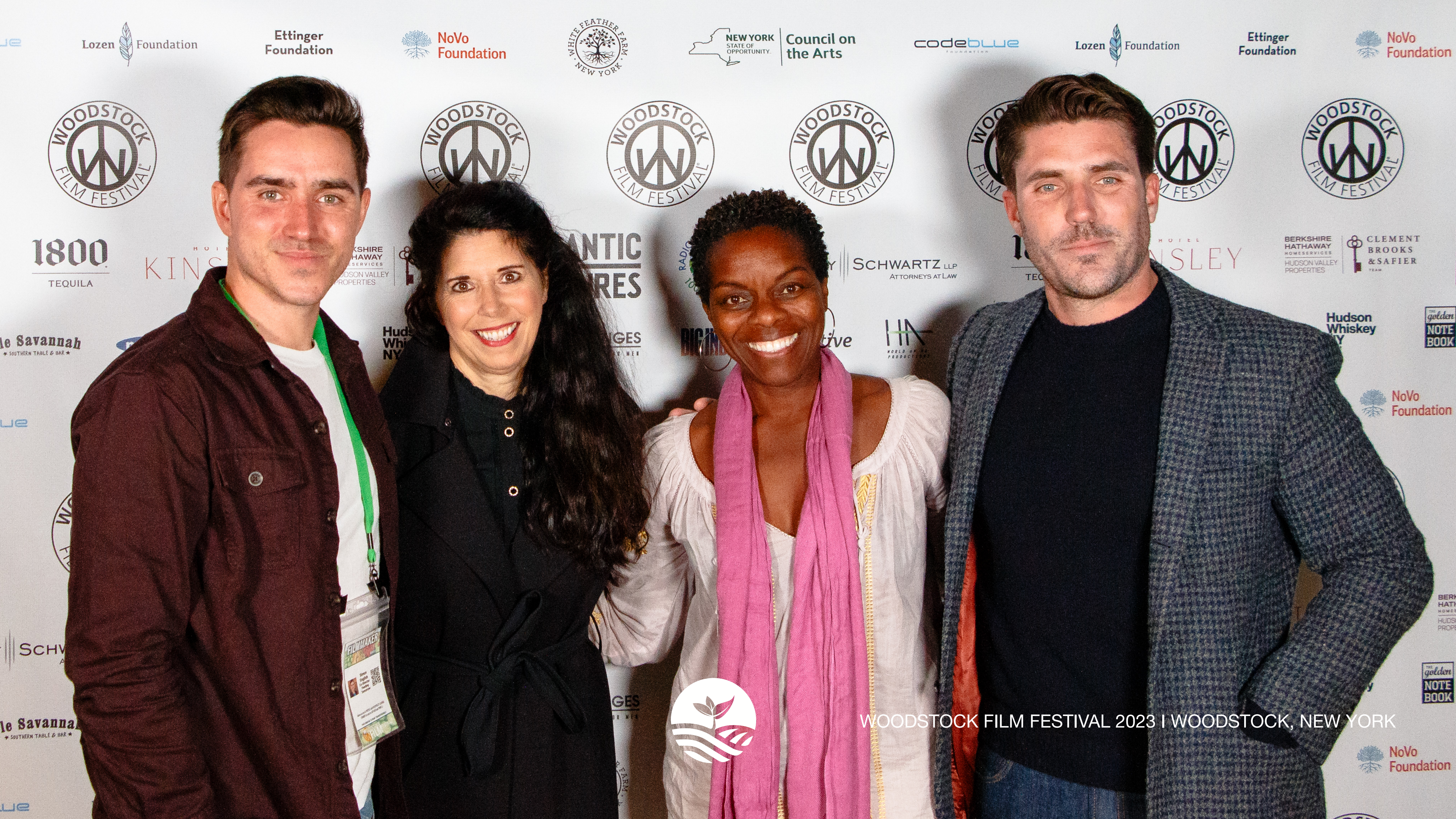
WOODSTOCK FILM FESTIVAL 2023 | WOODSTOCK, NEW YORK